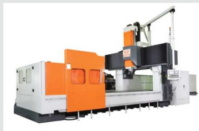
CNC MACHINING CENTRE